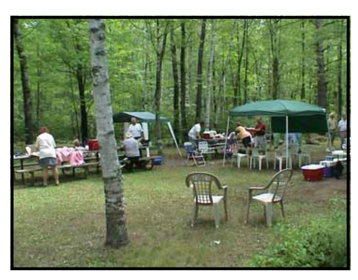
Above: Bar B Cruz Pictures with Minn Corvair Club Below left: Corvair Picnic and right: a "whale"