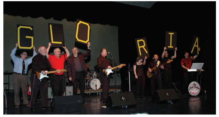
The Curb Feelers Join the Trashmen for Gloria