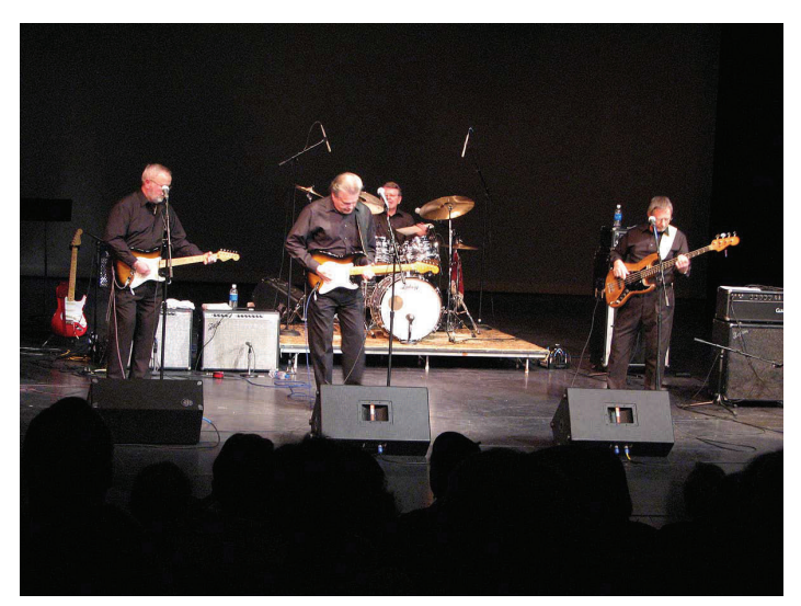
The Trashmen rock the house!!