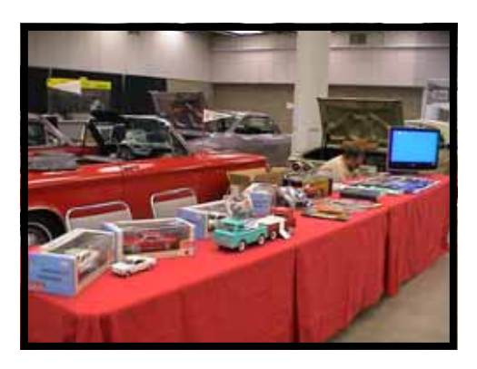
Here is our display table. Lots of things to look at.