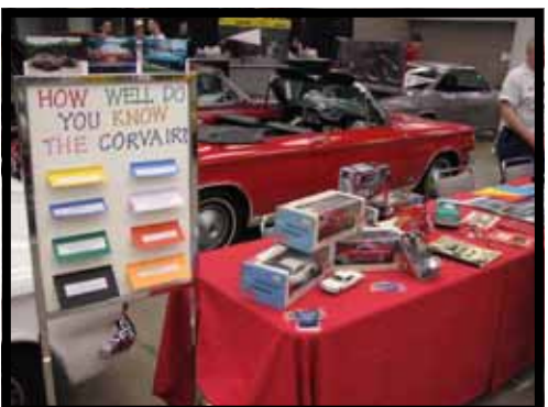
The display of "How well do you know your Corvair" was quite a hit. Almost everyone that walked by had to take a peek.