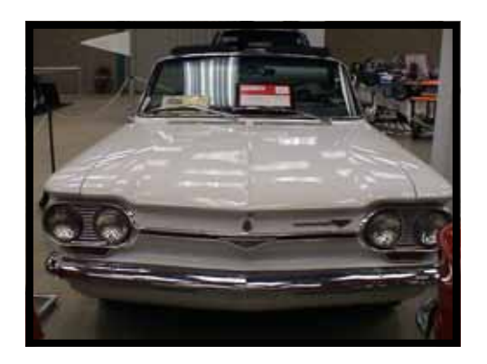
Dale Olson's convertible This car can tell some stories