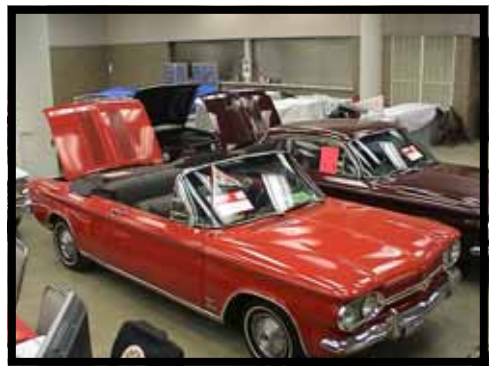
Jim Linder's Spyder looking good