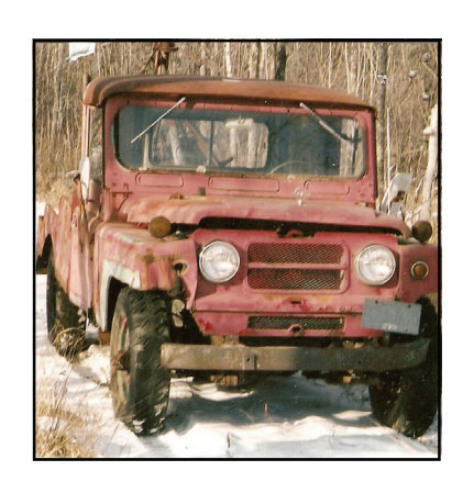
Art Bringe 721-3050

1966 Nission Patrol 4X4 Frame and Body Rough Running gear good. $600 Best Offer Or Trade for?