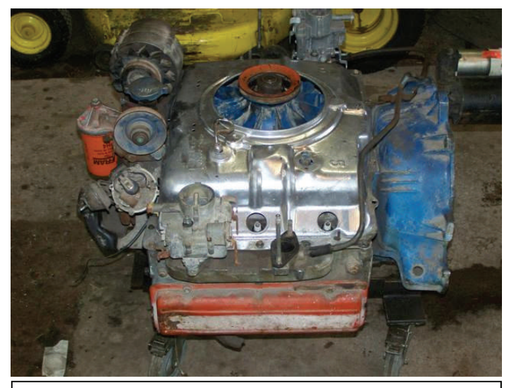
Here's another shot of Bob's 140 on the floor. After some more cleaning and swap over some parts we'll fire it up.