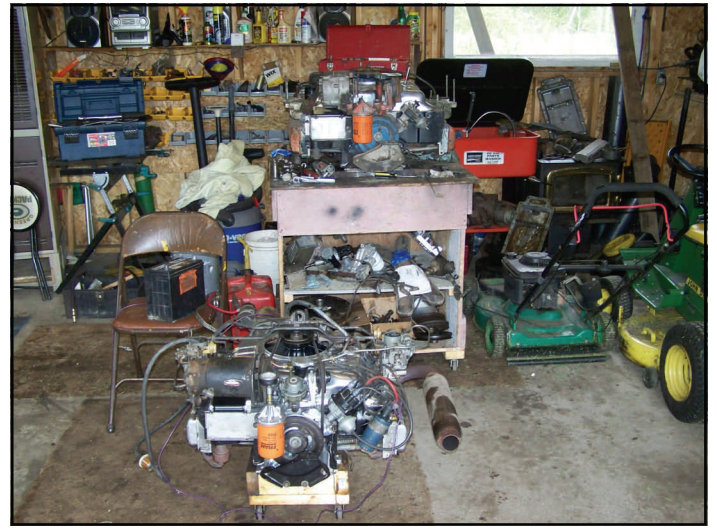
Bob's Saunders 140 on top of my home made engine bench with misc extra parts underneath. That's the spare 64 110 on the floor in front.