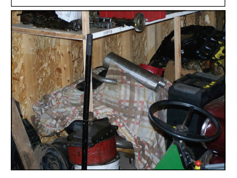
Dick Dee's engine stored covered and waiting for install. I fired it up this spring and it runs great.