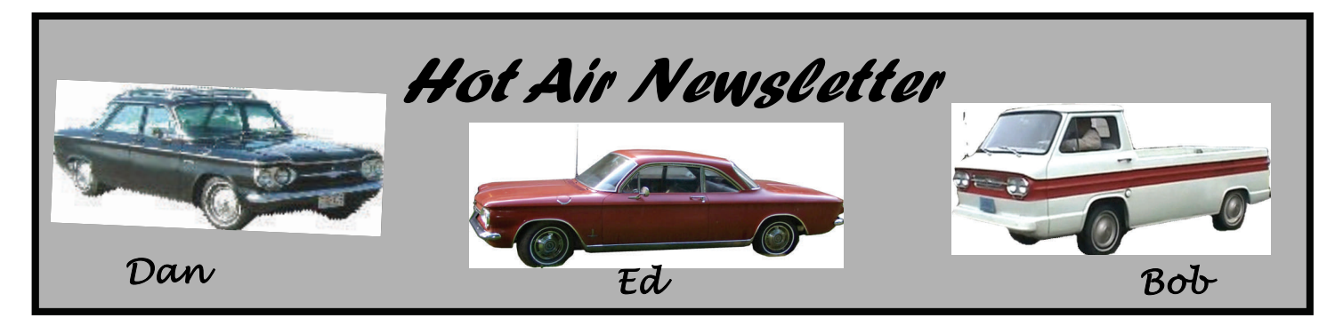
6/30/2009 Head of the Lakes Corvair Association Newsletter