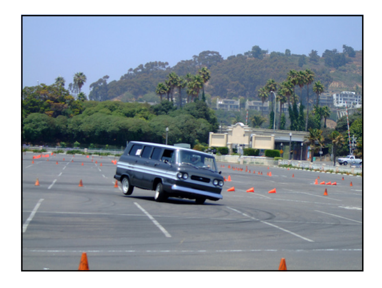
Up on 3 wheels