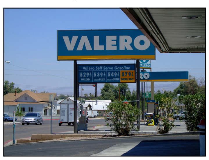
Think Gas was high here?