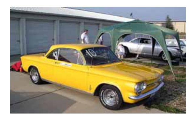
In the pit area. I think the car looks faster with the moons off the wheels anyway!