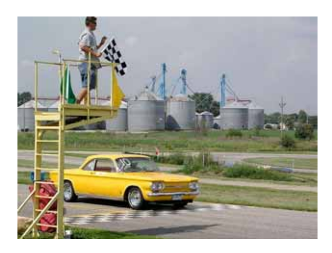
And this finish line shot looks pretty spiffy!

As far as the racing myself, I remembered to add air to the tires this time, and near as I can tell the car handled really good. Of course, different tires than last season, more air too. I still have to suffer with the horrible turn cutout trouble I have but I was expecting that as I just haven't got to dealing with the carbs yet. But had a great time and was very happy with the car and my performance. And I wasn't the slowest car this time!