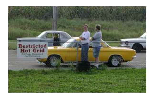
Waiting on the grid for my turn

As far as the racing myself, I remembered to add air to the tires this time, and near as I can tell the car handled really good. Of course, different tires than last season, more air too. I still have to suffer with the horrible turn cutout trouble I have but I was expecting that as I just haven't got to dealing with the carbs yet. But had a great time and was very happy with the car and my performance. And I wasn't the slowest car this time!