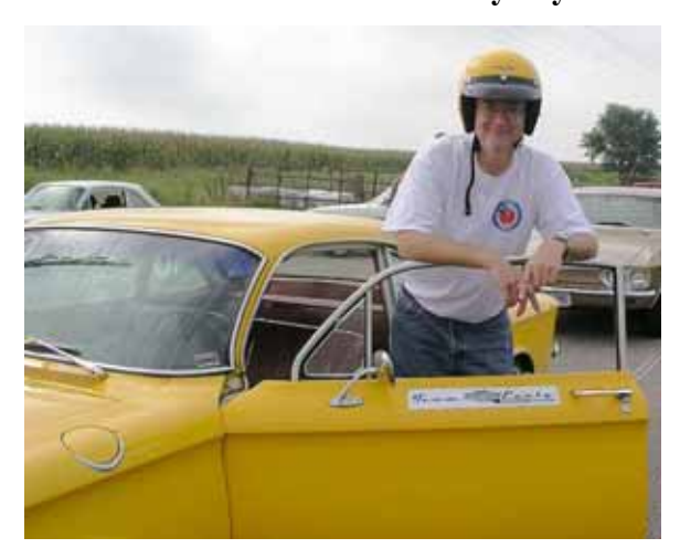
I look like Gazoo..the spaceman on the Flintstones with my helmet on!