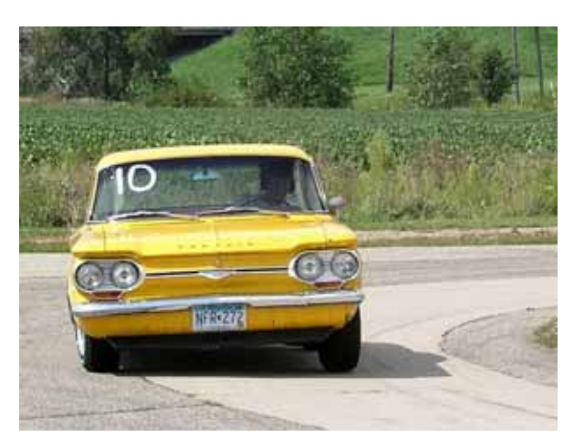
Gotta love the corner shots