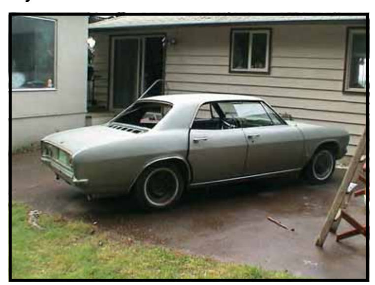
The car was a mess when I brought it home. My 16 yr old Step daughter seen it and said I have Dibs on it. She wanted it. After a lot of work it was back on the road again and a good daily driver.

The engine was shot but I picked up one from a club member that needed one to disappear. I sealed it up and got it running and it turned out to be a good car. Now I had 2 Corvairs and a big stash of parts. I stripped out a few engines so I had parts and engines hid all over. My next find was a 64 140 PG 4-door.